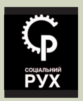
Organization Logo "Social Movement"

As International Workers Organizer, we took part in a meeting held in the Ukrainian battle front by the working class organization 'Social Movement'. In it, a new Minsk