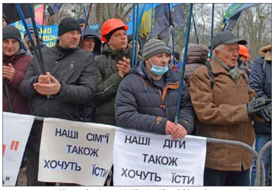
Mine workers' protest in Ukraine: "Our children also want to eat" (2022)

crossed the whole meeting. Pro NATO currents, such as UIT-CI, LIT, Bodart's LIS affirm Ukraine can win the war without breaking away from Zelensky government, NATO and imperialist Maastricht. These groups demand weapons from NATO, making imperialism look as "a liberation force for the oppressed nations".