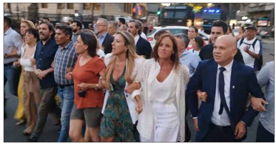
FIT-U MP's together with those of Kirchnerism outside the Congress in Argentina

Let us speak clearly... Some have even been asking themselves "how to build a revolutionary party in a reformist epoch". But when the crisis shakes them up and the bullets whiz by their heads, they immediately start talking about "economic crisis"