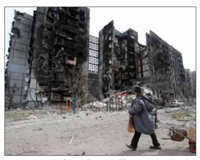
Ukraine devastated by Russian occupation

This "guest of honor" of the Buenos Aires conference has just spent years militating alongside Corbyn in the English Labor Party, the partner of the Tories in the City of London and NATO. No wonder then that his party is also in that den of bandits of the millionaire bourgeoisie of the African