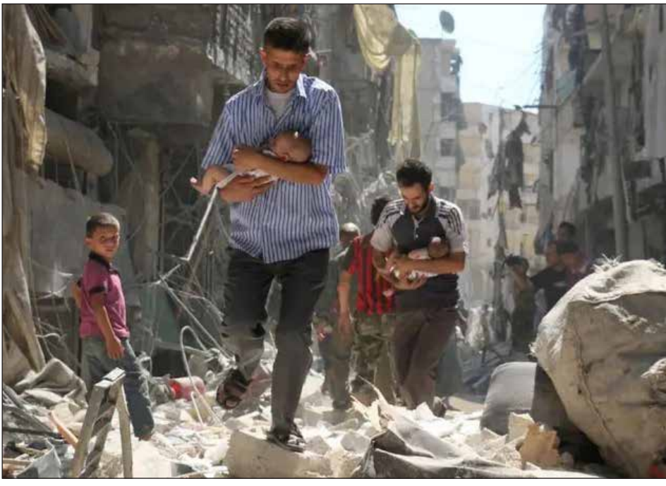
Massacre of the Syrian revolution

All of them deny the Trotskyist theory-program of Permanent Revolution, which in Ukraine means that only the working class together with the rank and file