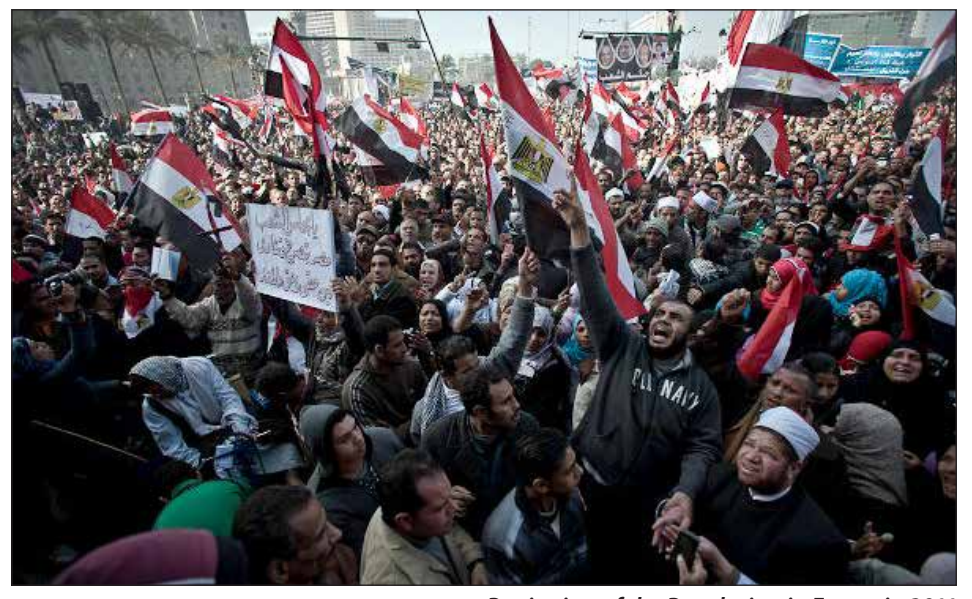
Beginning of the Revolution in Egypt, in 2011

While this was happening, in 2008 a brutal economic crisis broke out, with all the stock markets and the big US banks collapsing. But not only that, as the European banks, which had 70% of their investments in Wall Street, were also hit by this crisis. They immediately emptied the treasuries of the European states to cover their losses and launched a brutal attack on the working class of the coun-