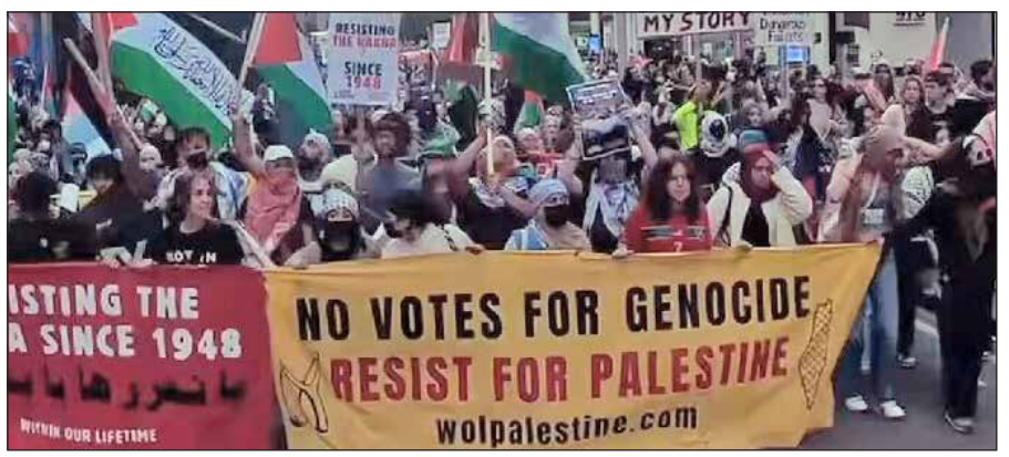
The Pro-Palestinian youth takes to the streets in the US on election day: "No vote for genocide!"

He is coming to carry Biden's job all the way by doubling down on the attack on the working class and the plunder of the oppressed peoples