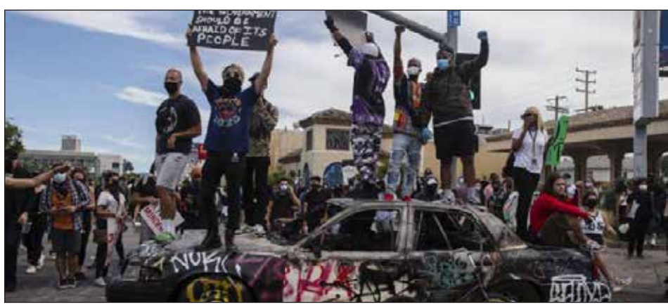
Uprising in the US against the Trump administration in 2020

During the Biden administration, immigrants were brutally targeted and imprisoned and even deported on a scale beyond that of the first Trump administration. The column of thousands of immigrants trying to enter the US, months ago, was contained