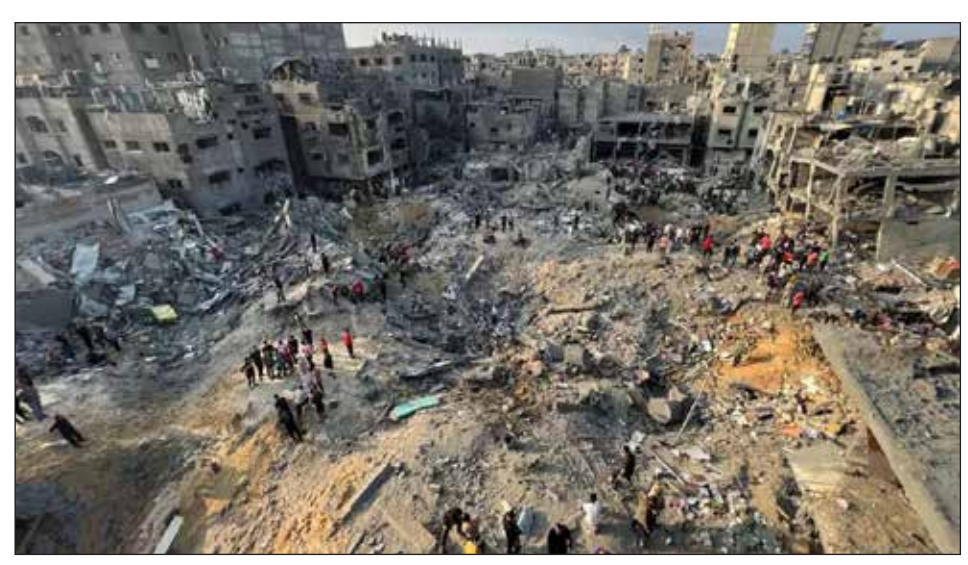
Gaza devastated by the genocidal offensive of Zionism and the US imperialism

The thousands of Palestinians in Jordan and the Palestinian fighters in Lebanon, the West Bank, the masses of the Maghreb and the entire Middle East must declare total war against the war of extermination of Zionism and the US!