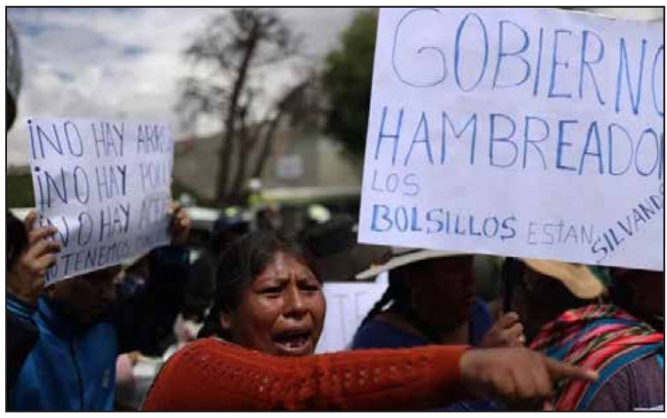
Protests against the high cost of living: "Starvationist government"

Anticipating the possible bloodshed, the peasants occupied three regiments, taking soldiers hostage and holding vigils in different barracks to prevent their own children from repressing them. Because at the army base there are the children of the working class and the poor peasant in arms. The situation got out of hand for Morales, so Arce. shielding himself even more, ordered