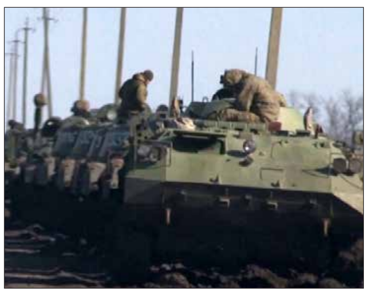
Russian troops enter eastern Ukraine

In World War I, we told the Russian, English and