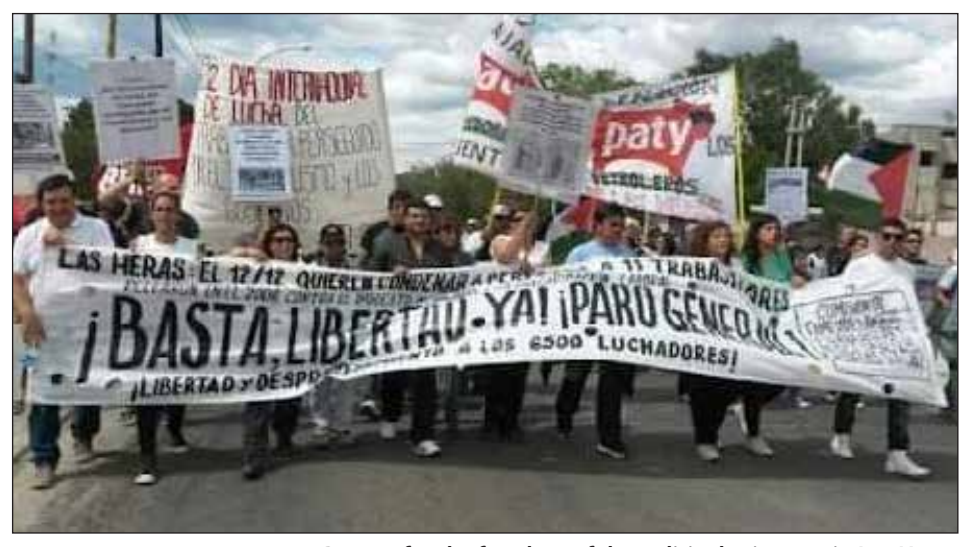
Protest for the freedom of the political prisoners in Las Heras

"Our hearts have always been and still are with Palestine because with them, we also faced the oil companies' tribunal that sentenced us"