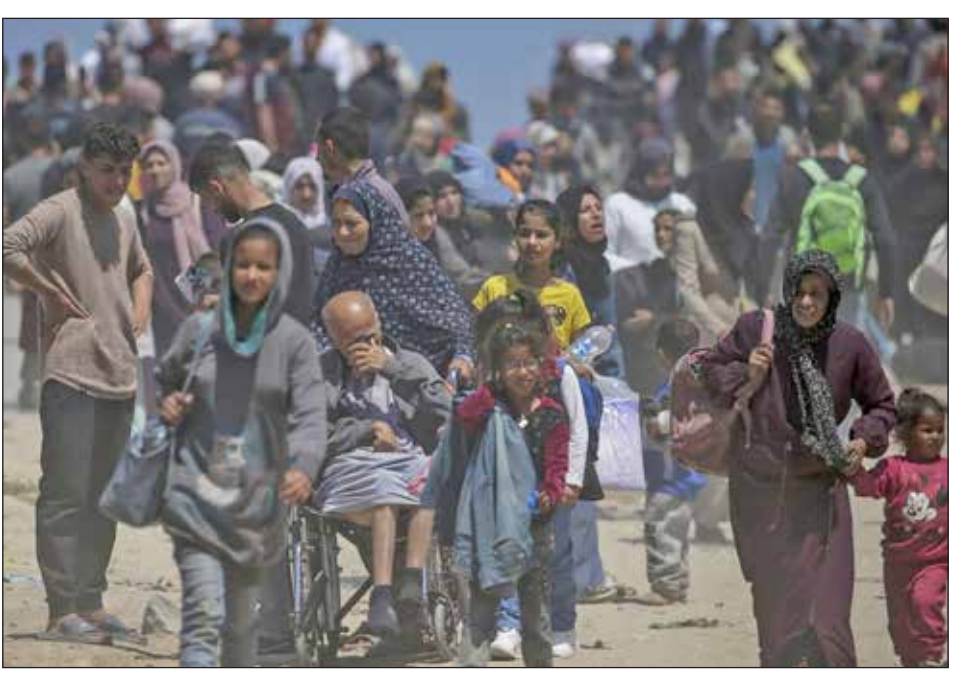
Millions of Palestinians displaced from their land

But the Palestinian masses resist in isolation. Just as the Geneva conference did for the Syrian masses— a conference in China was convened where all the bourgeoisies from the region met with Xi Jinping and Putin to act as "mediators" so that the Palestinian resistance surrenders, with the Zionist gun to its head. Once again, a conference to hand over