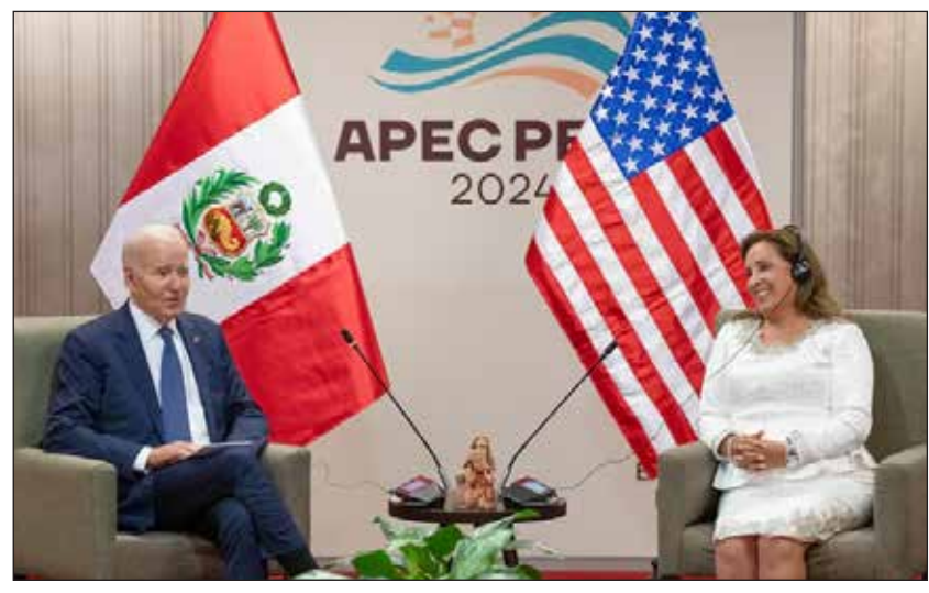
Boluarte and Biden meet in Lima during the 2024 APEC Summit

For a Continental Congress of worker and peasant organizations to promote a unified struggle alongside the workers of USA to expel imperialism and its lackey governments and regimes!