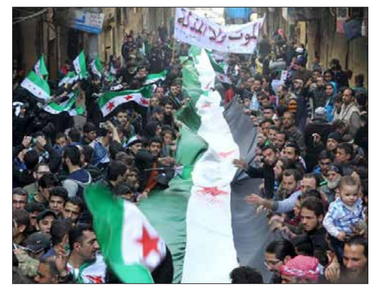
2016: The Syrian masses march against the fascist al-Assad

In fact, 15,000 Libyans, after having arrived in Tripoli, went to Syria, because they said: "We will win our revolution in Syria