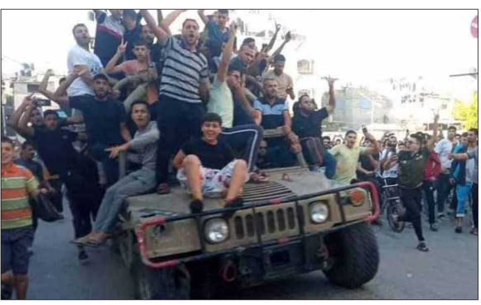
October 7, 2023: self-defense action of the Palestinian people

While Hamas tries to negotiate and puts the Arab and Iranian bourgeoisies as its allies, we are in favor of the uprising of the working class with their massacred sis-