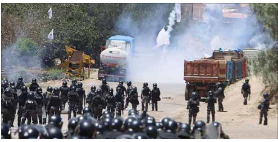
Police crackdown on peasants

For the expropriation of the banks without compensation so that the dollars that enter or leave are under the control of the workers' organizations. A single state bank to give cheap credit to the poor peasant. Nationalization of foreign trade un-