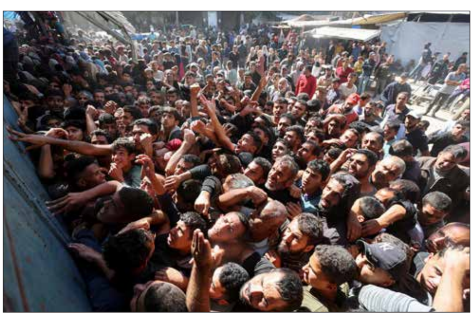
Palestinian masses in Gaza march to the shops looking for bread

begun to outstrip their leadership, not only conquering widespread armament, but above all by starting to expropriate the food stores and shops of the Palestinian bourgeoisie's hunger merchants who sell food to the besieged and massacred hungry masses of Gaza.