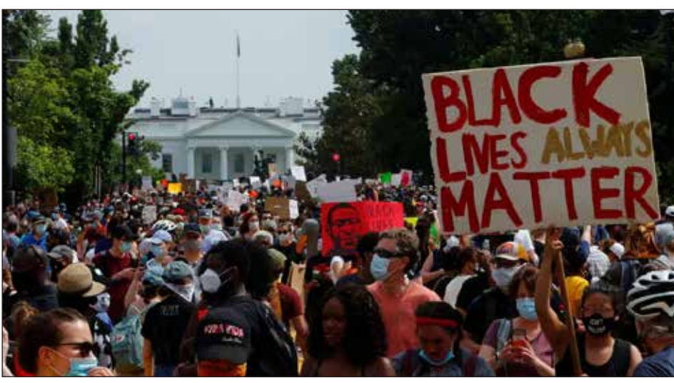
2020: revolutionary uprisings of the exploited in the U.S.

To be honest, any serious worker minimally perceptive will realize that these people try to cover the sun with a finger. They hide the fact they are the Mélenchon servants in France. They hide the fact that they had "critically" supported the Syriza government in Greece and were part of a movement for "A more social Europe" together with their former Minister of Economy, Varoufakis. They supported the fraudulent plebiscite of Tsipras that took the Greek masses out of the streets, while the Stalinist trade union bureaucracy beat up the left wing of the working class.