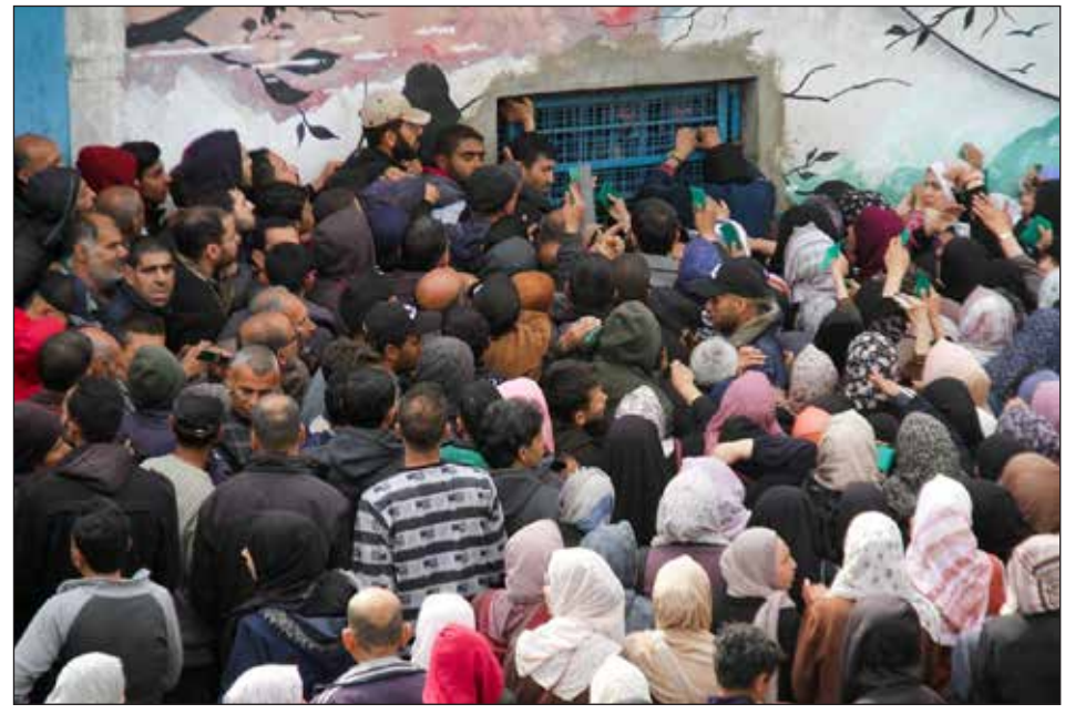
Hunger protests in Gaza

The Gaza Strip is a demolished and destroyed area, with its buildings and agricultural fields completely razed and poisoned with white phosphorus, where the fascist occupier has thrown two million Palestinians to live in a nightmare. Those who survive wander from one ghost town to another, from one destroyed refugee camp to another, and lately they have hardly any shelter left and are sleeping in the open air. 85,000 tons of bombs have fallen on Gaza. Hunger is unbearable. They have no more animal feed, not even weeds and grasses, everything has been eaten long ago or destroyed and nothing reaches them, because the Nazi-Zionist siege does not let them in. Zionism is thus using a powerful missile against the Palestinian masses: hunger.