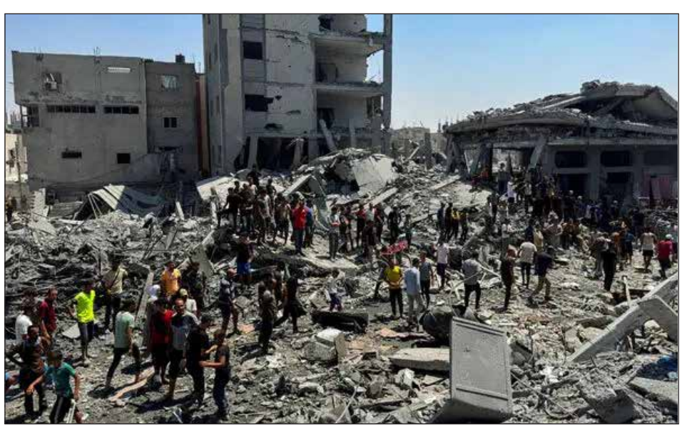
Holocaust in Gaza

By civil war we mean in the sense proposed by Trotsky: "civil war constitutes a definite stage of the class struggle, when the latter, breaking the frameworks of legality, comes to be placed on the level of a public and, to a cer-