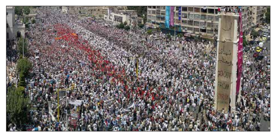
2011: demonstration in Hama at the beginning of the Syrian revolution

It is an immense pleasure to have the opportunity to speak on such an important occasion in the presence of resilient revolutionaries who continue to fight tirelessly for the oppressed class at a time when attacks against it are intensifying (...)