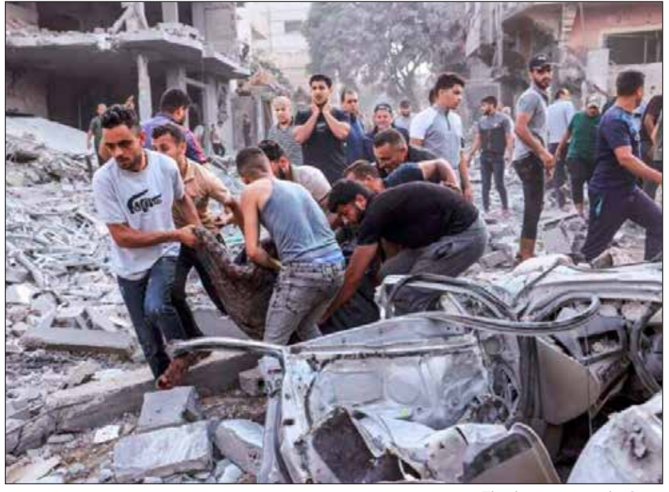
Zionist massacre in Gaza

"Today's event is a step forward to reconnect the theoretical-programmatic-organizational continuity of revolutionary Marxism..."