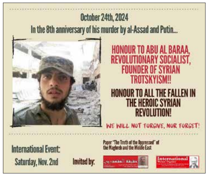
Flyer inviting to the international event

Groups and tendencies who claim to be part of the working class say that there are no workers in the Middle East, even more